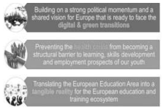
Visual: Achieving the European Education Area

The adoption of the new Digital Education Action Plan <sup>13</sup> supports the deployment of digital technologies needed for education and training, and equipping all citizens with digital competences. The Commission has proposed in August 2021 a Council Recommendation on blended learning to provide better support to schools and learners affected by the digital shift of the pandemic among others through additional learning opportunities and targeted support to learners facing learning difficulties.<sup>14</sup>