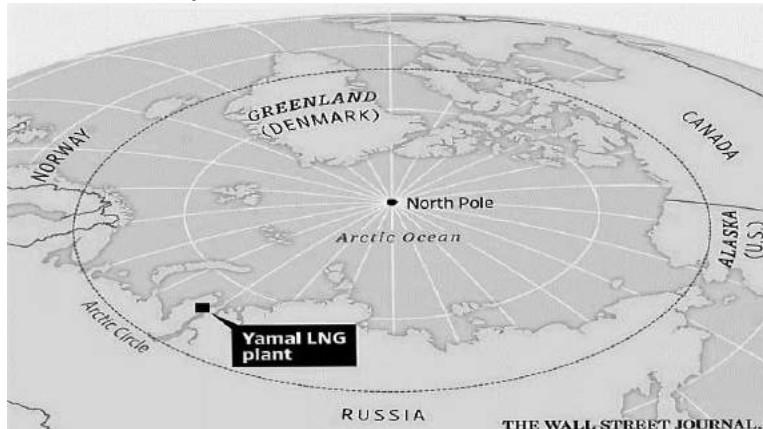
Figure 7: Yamal LNG plant