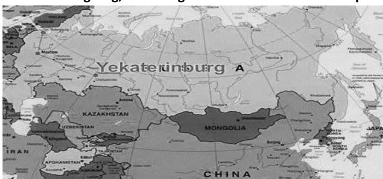
Figure 6: Yekaterinburg, a dividing line between Asia and Europe