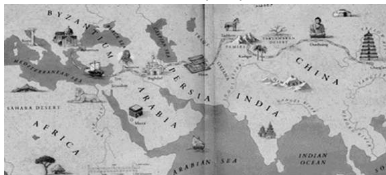
Figure 3: Ancient silk route and HAN dynasty