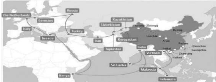
Figure 1: OBOR runs through Europe and Asia