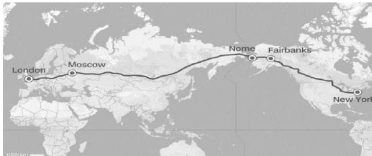
Figure 2: Trans-Eurasian Belt Development (TEPR)