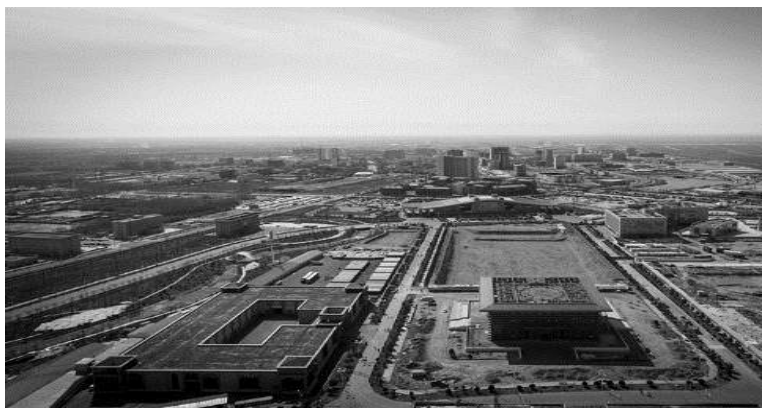
Figure 8: Horgos at China-Kazakh border